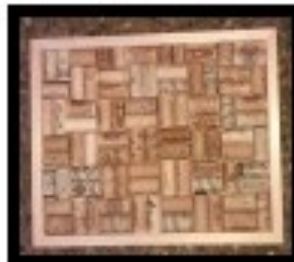
Trivet or Corkboard